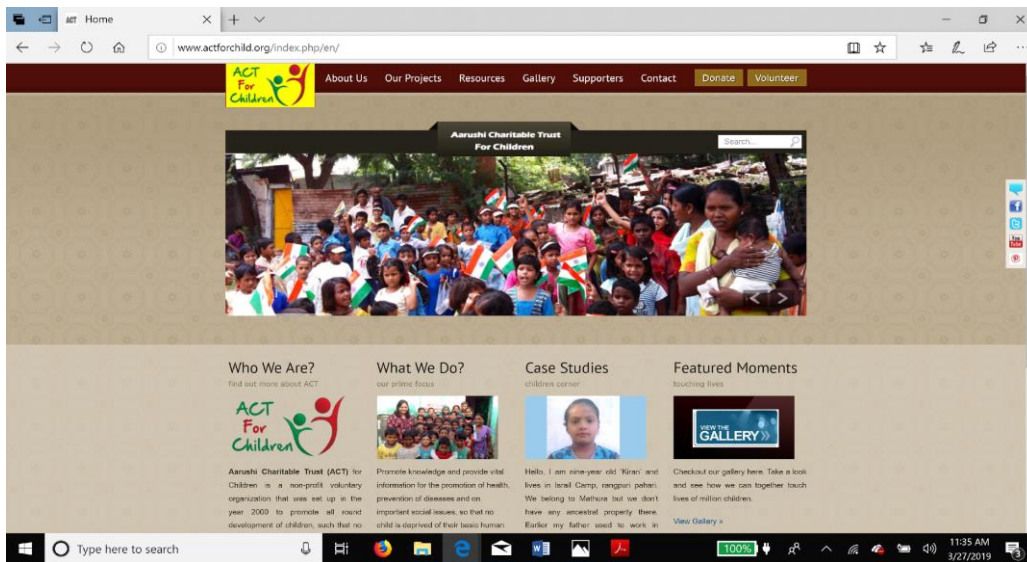
Front Page of the website